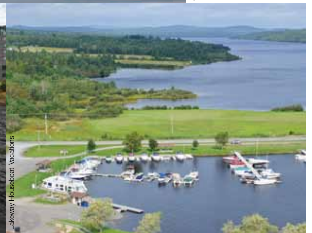
Lakeway Houseboat Vacations

Cottage on the water: this rental houseboat (opposite) features a fireplace, a barbecue, a waterslide, and an upper-deck hot tub. Below, from left: approaching Fredericton by canoe; houseboats dock at this Mactaquac marina on the St. John River.