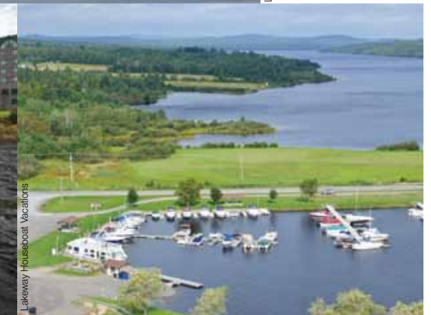
Lakeway Houseboat Vacations